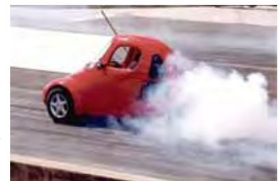
"The company was founded at the track"

For more information please go to http://www.alltraxinc.com